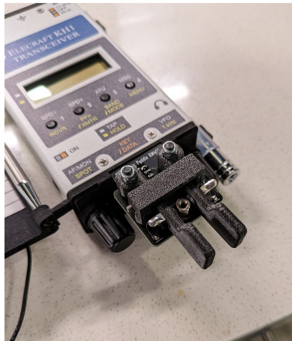
Elecraft KH1 Iambic Paddle