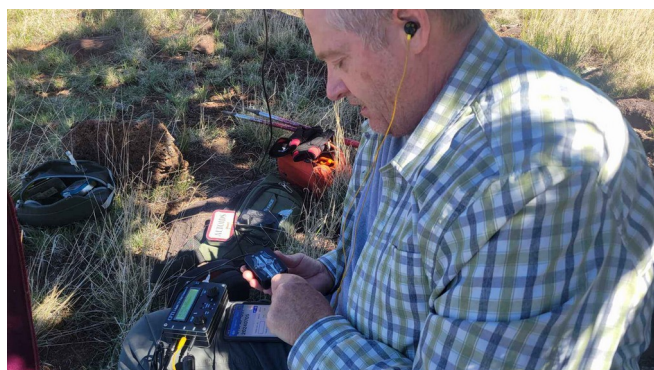
Charlie NJ7V, Red Summit RF activating a SOTA summit with the CFT1