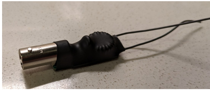
End Fed Unun Kit, QRP and 20 Watt Editions

https://www.ebay.com/str/radiodanw7rf or https://HamGadgets.com